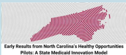
Early Results from North Carolina's Healthy Opportunities Pilots: A State Medicaid Innovation Model