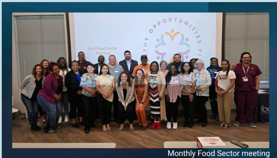
Monthly Food Sector meeting

https://www.ncdhs.gov/documents/healthy-opportunities-pilots-interim-evaluation-report-summary/open